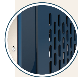
Punched for ventilation